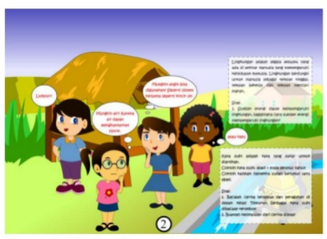
Figure 3. The backyard lift the flap