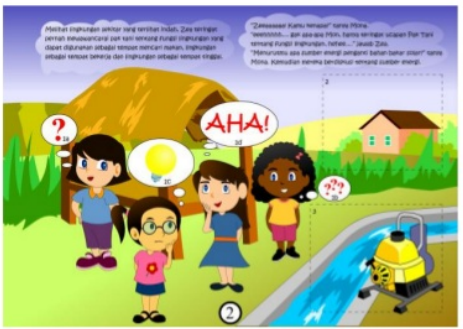
Figure 2. The front page of the lift the flap

Sartono, E.K.E. & Irawati, E. (2019). The effect of child-friendly lift-the-flap story books on the creative thinking ability. International Journal of Educational Research Review, Special Issue, 734-741.